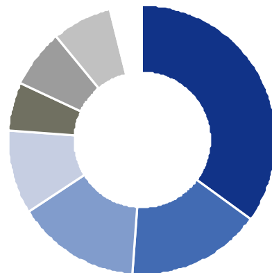
Lines of business 3